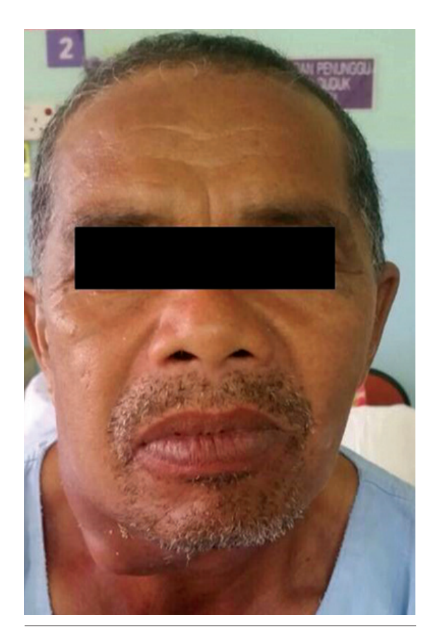
Figure 1: Visible swelling over the right submandibular region.

mucopolysaccharides. Small amounts of other salts such as magnesium, potassium, and ammonium are also involved in calculus formation.<sup>5</sup>