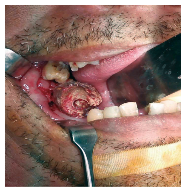
Figure 3: Intraoral removal of the calculus.

aggregation of mineralized debris to form nidus, which ultimately leads to the formation of calculi.